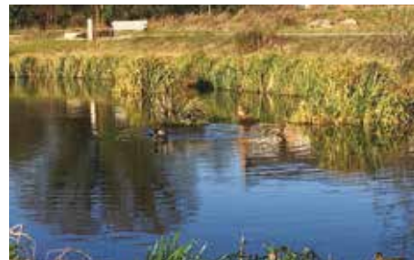
Firs Farm, LB Enfield

Following consultations with local residents and park users, the Friends wished to provide bulbs which will encourage pollinating insects such as bees, butterflies and hoverflies to further enhance this special space for both residents and wildlife. They wanted to ensure that the planting should be colourful, attractive to pollinators and encourage a good habitat. Everybody in the community now has access to Firs Farm and naturally the bees, butterflies and beetles have also benefitted. MPGA awarded the Friends of Firs Farm £200 to purchase bulbs and grasses.