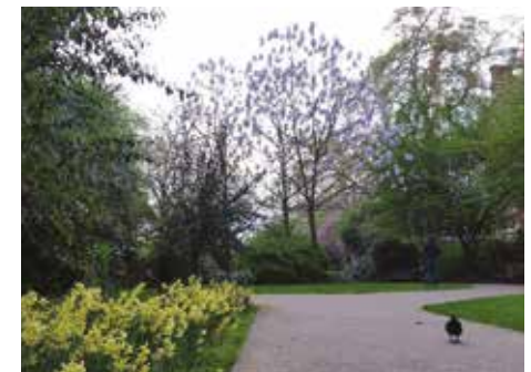
Temple Gardens, City of Westminster