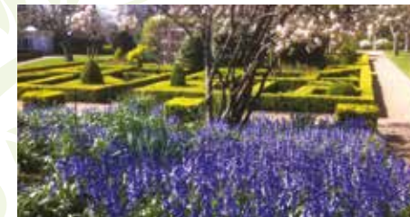
Trumpeters' House, LB Richmond

Over 230 gardens in London, from Kingston to Rainham, took part in Open Garden Squares Weekend this year. 2017 marked the 20th Anniversary of the event and was the largest yet, with a lot of new gardens including Baring Asset Management rooftop garden, The Deanery in Southwark, Hachette UK, and Trumpeters' House. Together there were more than 45,000 individual garden visits, over 3,000 of them from children. The event involved some 900 volunteers in various capacities and, as well as opening gardens, included Poets in Residence, 60 guided walks and many other activities. The Trust is a not for profit charity and the support of the MPGA is vital, enabling them to prepare for this once a year celebration of London's green spaces.