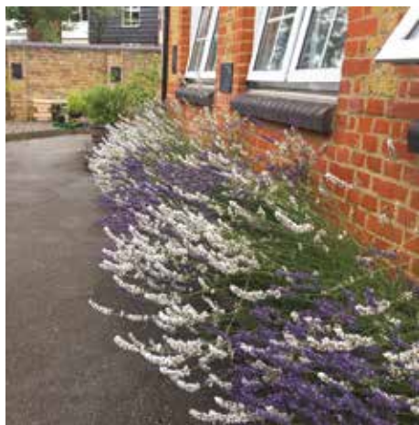
Christ Church Primary School, LB Wandsworth - Lavender Border

Having previously received an MPGA grant to build raised beds and buy compost, a further grant enabled them to purchase flowers and shrubs to complete the project.