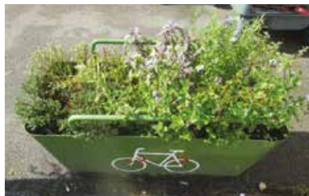
NorthWestTwo, LB Brent - bicycle lock planter

This community group in Cricklewood wanted to improve a rather neglected area and engender civic pride through planting. They had already provided planting troughs to brighten up a kerbside barrier. The MPGA