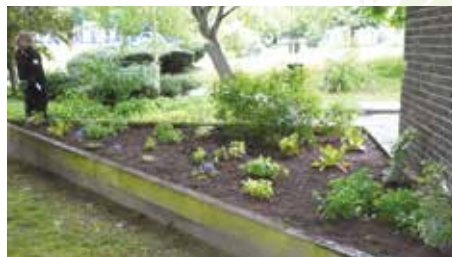
Salisbury Row Park, LB Southwark

park features a shady triangular raised bed, which the MPGA granted funds to plant up with appropriate plants to green the area and inspire others with similar situations in their own gardens. The plants are labelled with information for the public and the bed is maintained by the Friends' Group.