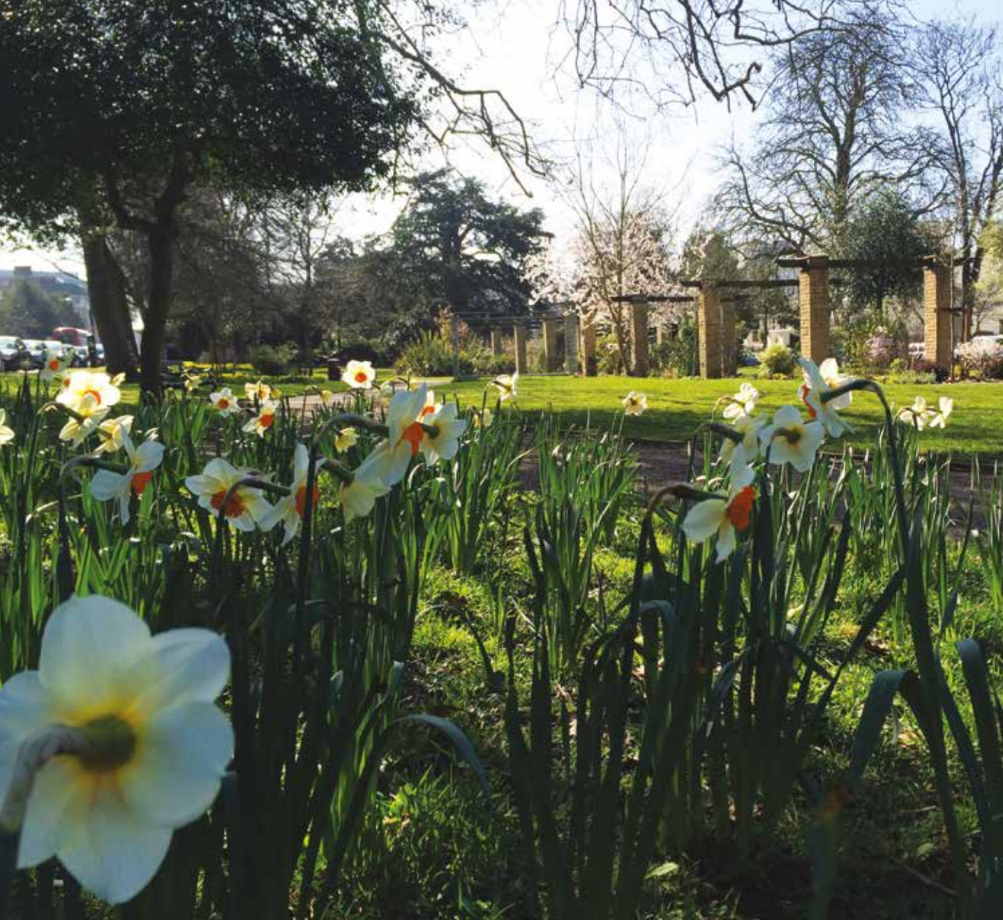
Claremont Crescent Gardens, Surbiton, RB Kingston-upon-Thames

Front cover picture: Nomura Roof Garden