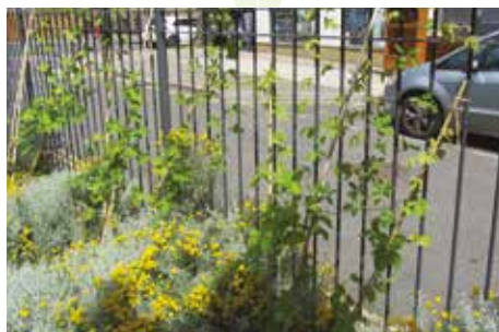
Climbers in New Clocktower Place Garden, Caledonian Park, LB Islington

New Clocktower Place Garden is a relatively newly created garden space in Caledonian Park. It is located in the middle of a mixed residential redevelopment and is flanked by residential roads and overlooked on both sides by recently redeveloped five storey blocks of flats. The garden links Caledonian Park with the business and public transport facilities of North Road, N7. The MPGA provided a grant for over 100 climbing plants to cover the full length of the bare perimeter railings to make the area more