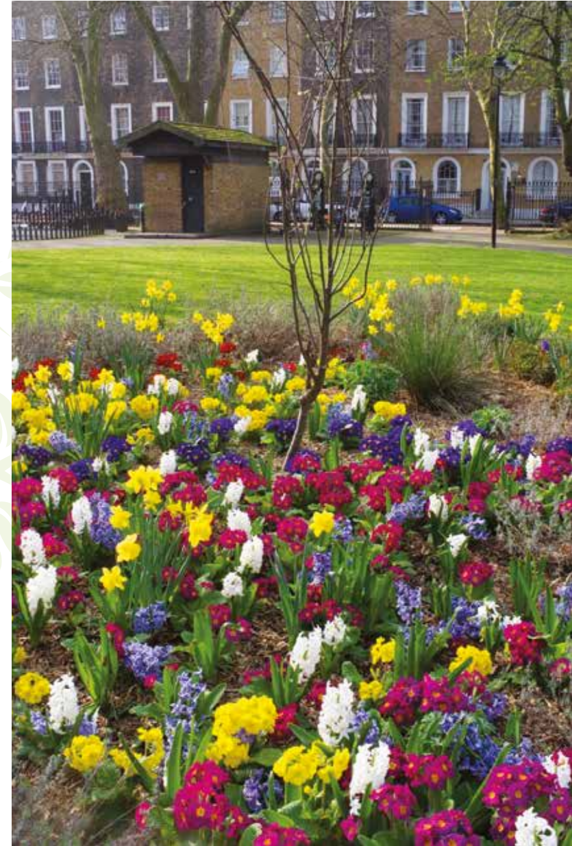
Argyle Square, LB Camden

Hon Treasurer, MPGA, 14 Magnolia Way, Cheshunt, Herts EN8 0FD