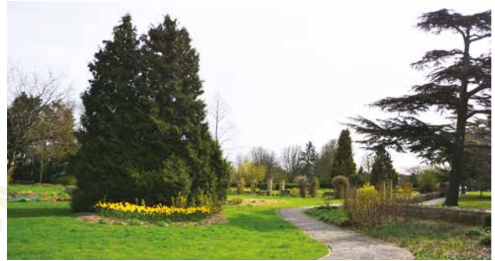
Danson Park, LB Bexley