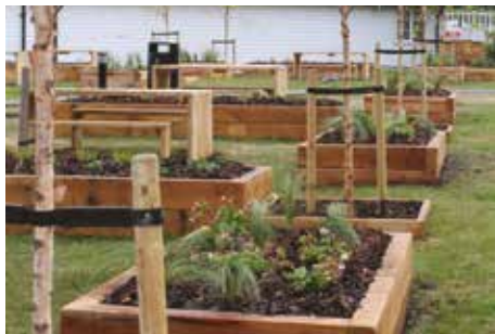
Maudsley Hospital Courtyard, LB Southwark

involved in developing the planting designs and helped to plant the gardens during community planting days. The MPGA were pleased to be invited to contribute to this major project, and provided funding for fruit trees, hedging shrubs and other plants.