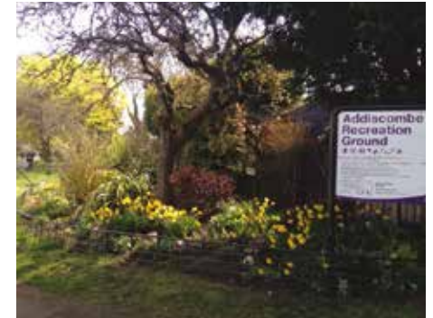
Addiscombe Recreation Ground, LB Croydon

Our very grateful thanks go to Taylor's for their tremendous ongoing support. Their bulbs, which are world class and regular Chelsea prize-winners, are now spread across over 600 London sites, bringing colour and joy each Spring to residents and visitors alike.