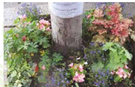
NorthWestTwo, LB Brent - tree pit edging

were pleased to supply the funds to purchase plants for these troughs, as well as funds to purchase edging for tree pits to encourage local residents to plant and maintain their own patches, and for herbs to reinvigorate the community herb garden – free for anyone to help themselves – in a bicycle lock planter.