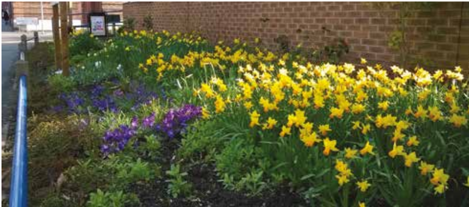
Age UK Centre, LB Merton