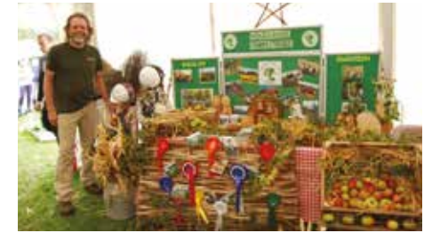
Woodlands Farm Trust, RB Greenwich

In 2017 the London City Farms & Community Gardens Association applied for a grant to support its 19th annual London Harvest Festival. Projects from 11 different London Boroughs competed in the horticulture events. The MPGA has supported the show for many years by providing two prizes, one for the Best Display from a Garden at a City Farm, and one for the Best Display from a Community Garden, won this year by Woodlands Farm