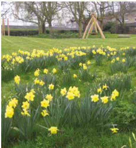
Dartmouth Park, LB Islington

As in previous years, the bulb recipients came from a wide cross-section of parks, gardens and organisations across the London boroughs, including nature reserves, fire stations, memorial gardens, railway stations and allotments. In 2017, we reached out to the London hospices and are delighted to report that six of them received bulbs: Haven House Children's Hospice LB Waltham Forest , Greenwich & Bexley Hospice, St Joseph's Hospice LB Hackney , Marie Curie Hospice Hampstead , St Francis Hospice LB Havering and St Christopher's Hospice LB Bromley .