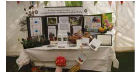
St. Mary's Secret Garden, LB Hackney

Trust and St Mary's Secret Garden, Hackney respectively. Prizes help celebrate the achievements of young and adult volunteers who cultivate the exhibits. Prizes also boost excitement and morale which encourages engagement in community volunteering.