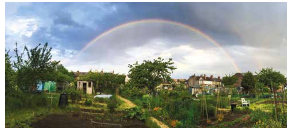
Northfield Allotments LB Ealing

We've also been following the campaign of Northfields Allotments in Ealing, which has been highlighted in the London Evening Standard. Thousands signed a petition demanding the preservation of the allotments, which are the oldest in London dating back to 1832. Part of the site had been earmarked for housing for the elderly. Although the Allotment Society recognises that there is a housing shortage in London, they feel that this should not override the wider needs of local communities and the environment, as it would represent an irreversible loss of scarce green space. We've now heard that there are other issues involved and the development plans have been put on hold, although the threat