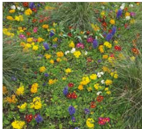
Shoreditch Park, LB Hackney