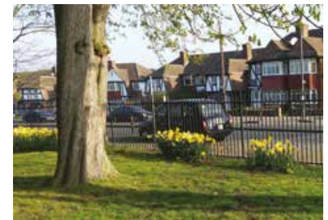
King George's Playing Field, LB Merton