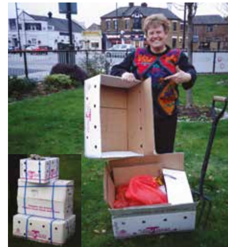
Planting at Pensford Field, RB Richmond