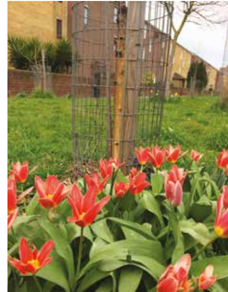
Rhodes Estate, LB Hackney