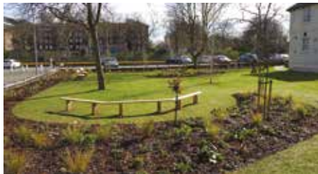
Orchard at Maudsley Hospital, LB Southwark

The Maudsley Hospital provides in-patient and community mental health care to thousands of people from across the country. The publicly accessible outside spaces running through the site were bland, under-used and lacking in greenery and so a plan was developed in conjunction with Trees for Cities to transform those areas into beautiful gardens for patients and local residents. The hospital community were