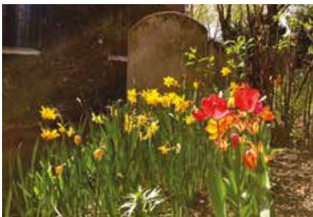
Bow Church, LB Tower Hamlets